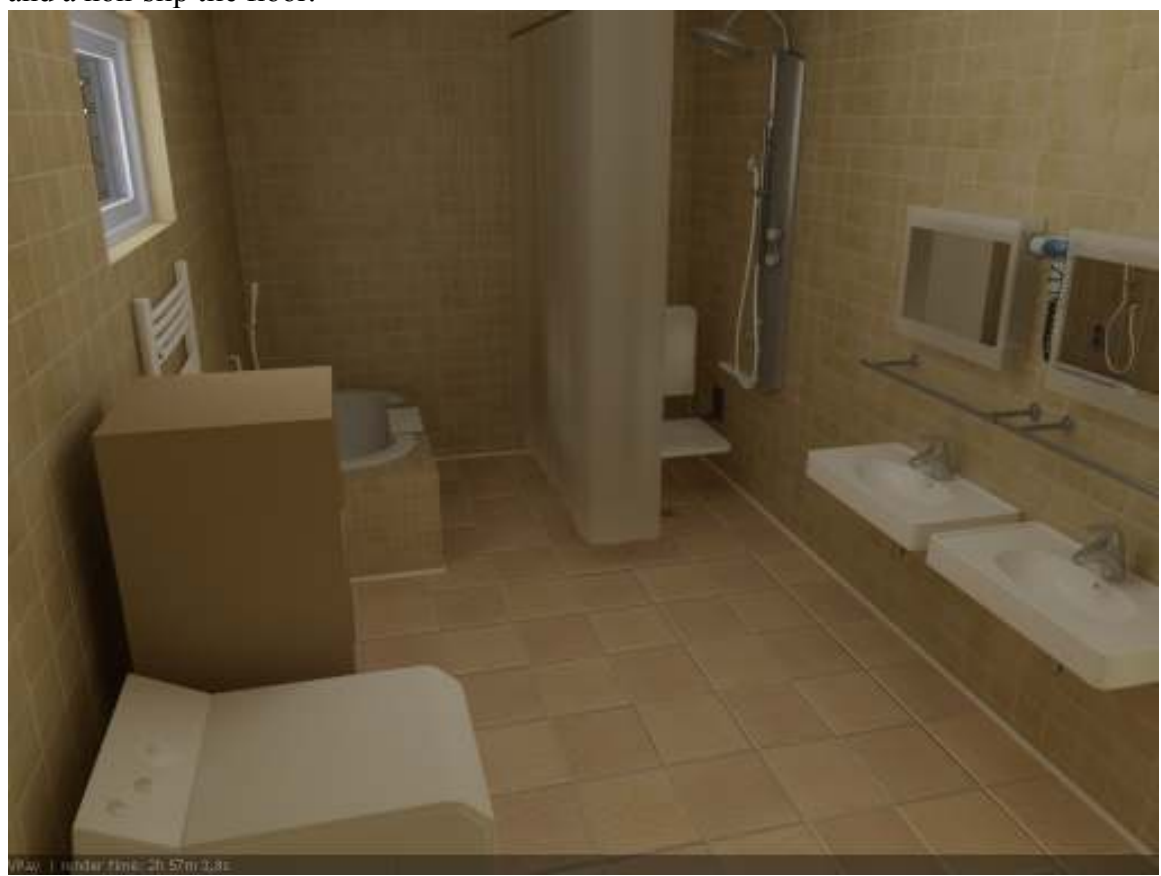
Figure 3. View of the bathroom, with position of the roll-in shower with shower seat, loose hand-held shower, laundry machine (top-loader), heating panel for warming towels and a non-slip tile floor.

Some studies on utility and usability of technology at home (Bjørneby et al., 2004; Orpwood et al., 2004) have resulted into a series of general guidelines and design recommendations for technology for people with early to mild dementia. Technology and equipment should (i) not require any learning, (ii) look familiar, (iii) not remove control from the user, (iv) require a minimum of user interaction, and (v) reassure the user (Orpwood et al., 2004). Some people with dementia are curious about new equipment and are often uninhibited about dismantling it to "find out how it works" (Adlam et al., 2004), and technology should therefore be robust. Moreover, this group of older adults needs rapid responses to perceived difficulties, as they are often unable to understand the reason for a fault occurring, or work around it (Adlam et al., 2004). These statements and requirements have led to a very conservative introduction of technology in the dementia dwelling.